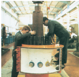
3000 psig boiler circulator pump during re-build after rewind and major shop overhaul

Weir Services Turbomachinery Engineering has the facilities to overhaul and repair these specialised pumpsets which can operate at conditions of 3000psig, temperatures of 350°C and up to 6.6kV.